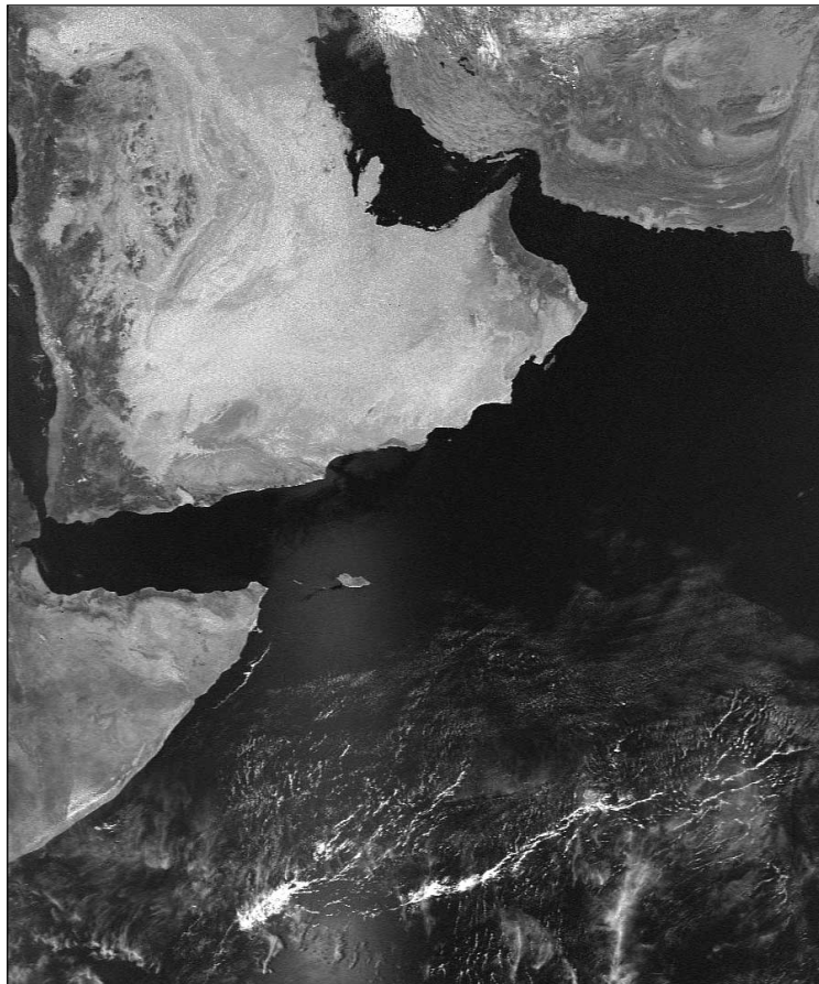
The Arabian peninsula - NOAA-18 at 09:49 UT on March 2, 2006

Although my wife and I had already visited Goa for two weeks last December, we went there again in February/March for a few weeks. This latest time I brought along my weather satellite gear,